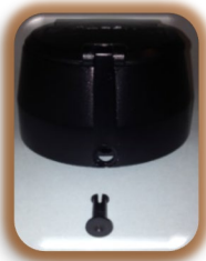
Register Assembly Seal Pin

**Please note Register Assembly Seal Pin will be removed for competition.